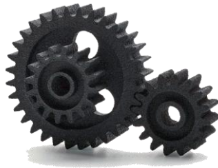
Picture taken after dye post-processing

Get precise small features and detail such as small fine holes, walls and shafts with dimensional accuracy thanks to HP's unique Multi-Agent printing process