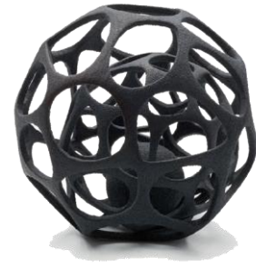
Picture taken after dye post-processing

Robust thermoplastic that optimizes part quality with cost, producing strong structures